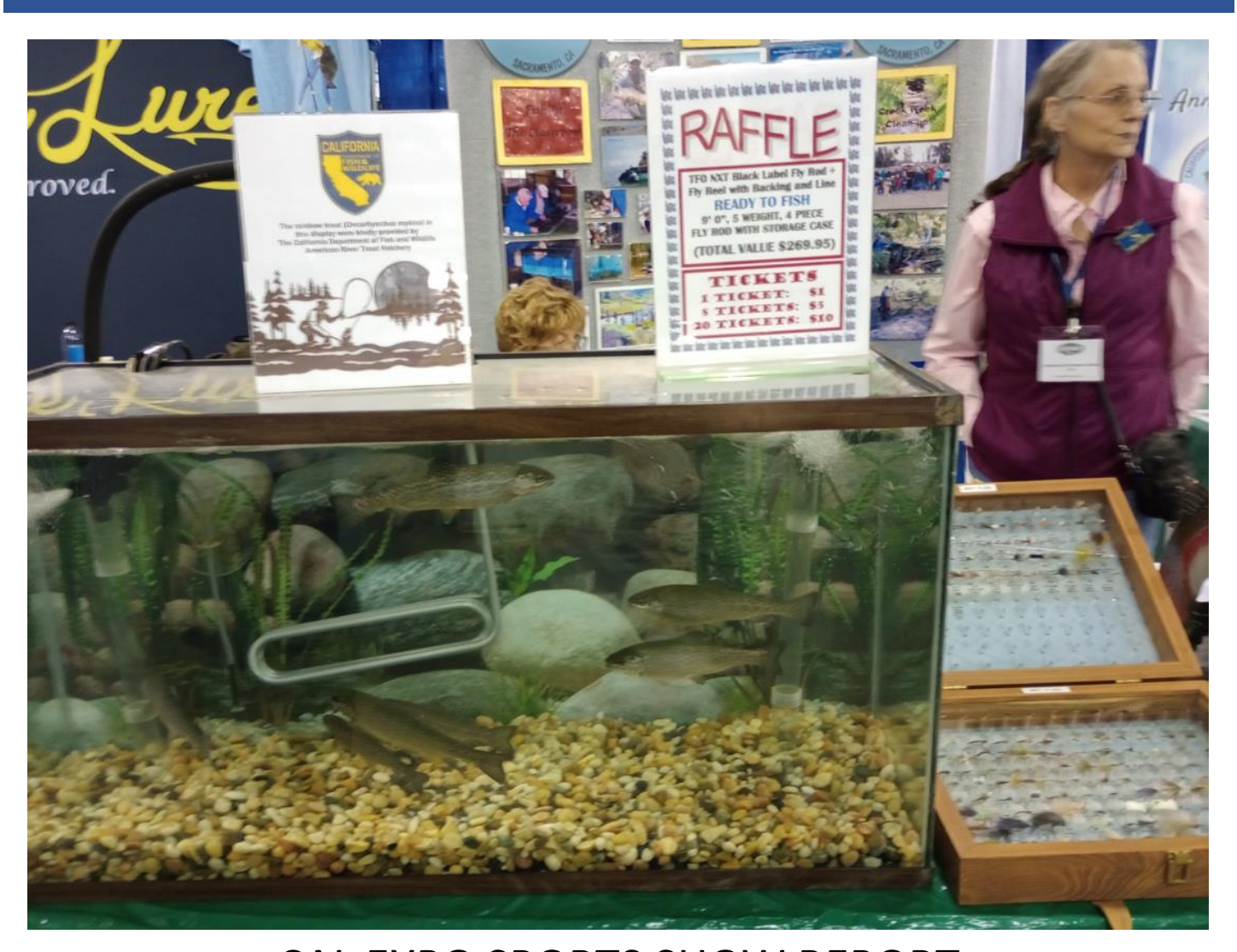
CAL EXPO SPORTS SHOW REPORT