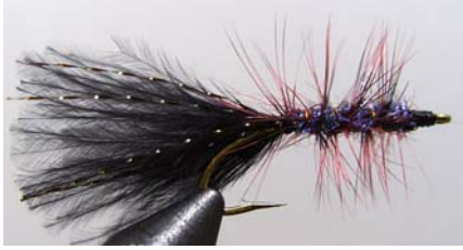
Jim Wright tied a Seal Bugger on a #6 hook with black thread, black marabou and black crystal flash for the tail, copper wire rib, body of gray ice dub, purple grizzly hackle palmered over the body.

To be part of the Fly Tier's Exchange, just tie up 12 flies, turn them in to the exchange at the beginning of the meeting, and the exchange will distribute the participants flies to one another; you do not get your contribution back; you get everyone else's work! It has to be one of the best values that CFFU has. Your pattern can be of different sizes, but generally the flies are all the same pattern, the same size.