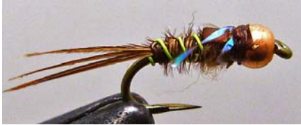
Jim Berdan tied a Hogan's S & M Nymph on a Tiemco 3761, #16, 2mm copper bead, 8/0 brown thread, 5 or 6 pheasant tail barbules for the tail, abdomen pheasant tail, chartreuse wire rib, olive brown dub thorax, brown goose biot wing case, 2 strands pearl crystal flash for legs.

To be part of the Fly Tier's Exchange, just tie up 12 flies, turn them in to the exchange at the beginning of the meeting, and the exchange will distribute the participants flies to one another; you do not get your contribution back; you get everyone else's work! It has to be one of the best values that CFFU has. Your pattern can be of different sizes, but generally the flies are all the same pattern, the same size.