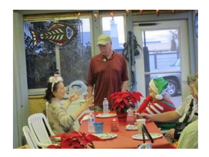
Please Support Our Generous Sponsors: