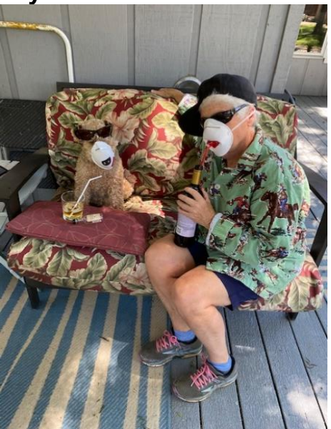
Discussing the merits of Fetch