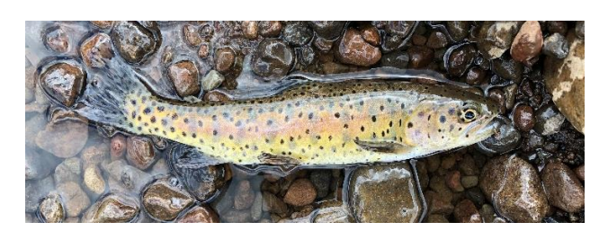
Lahontan Cutthroat Trout